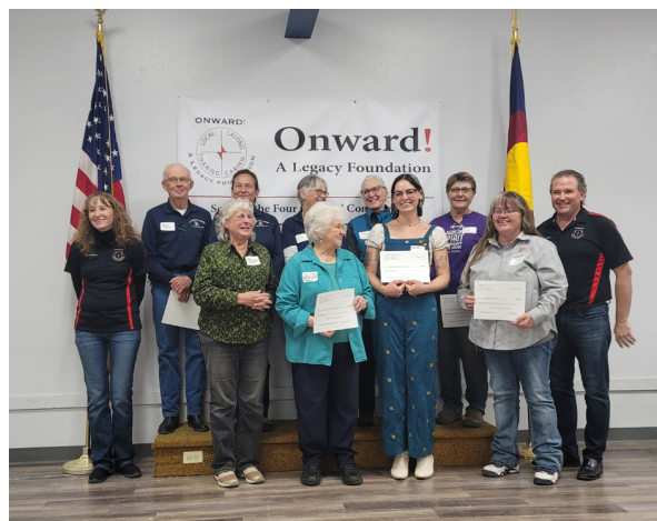
2022 General Endowment Enhancement Grant Recipients